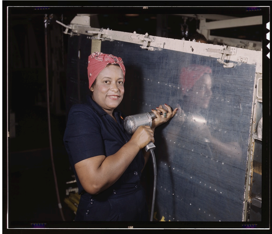
A female worker in 1939 operating a hand drill at a factory in Vultee-Nashville, Tennessee. Public domain. Available at the Library of Congress: https://www.loc.gov/resource/fsac.1a34808/

United States History: 1865 to the Present