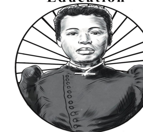
Lucy Craft Laney