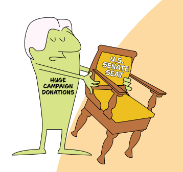
MORE EQUAL THAN OTHERS