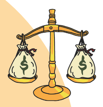
A BALANCING ACT